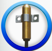
KTS-10K_TM TRANSOM MOUNT